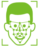
Access Control System

Our Pro series tripod turnstiles represent classic and safe way to protect your premises. They are used in various indoor environment applications. They fit perfectly as an economical option in the office buildings and other related applications.